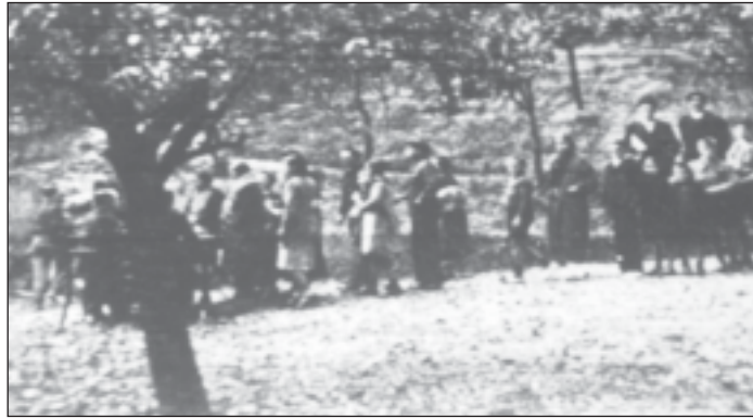
Children lined up for medical examination near Bilbao, Leicester Mercury, 10th June 1937.

small supplies of oranges and olive oil, but only a minimal amount of fresh vegetables. One pregnant mother who brought up five healthy looking children for examination was herself so weak she could hardly stand, and said, smiling, that perhaps she would find some time to eat when her children were in England. Perhaps the most surprising feature of the examination was the good health of the group as a whole, in spite of the conditions of deprivation, anxiety and overcrowding in which they had been living for many weeks. It was evident that even the poorer peasants have a high standard of care for their children, and that before the blockade almost all the latter were well-developed and well fed. The very high incidence of dental caries, however, is probably attributable at least in part to the deficient diet.'