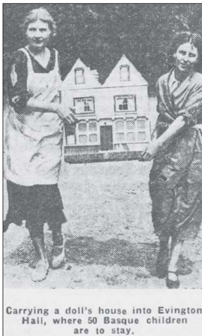
Carrying a doll's house into Evington Hall, where 50 Basque children are to stay.