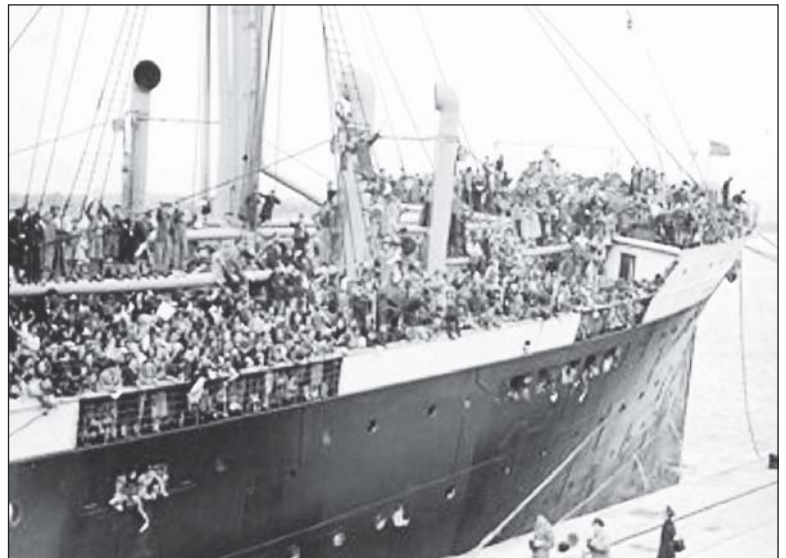
Basque refugee children on board the SS Habana about to depart Bilbao for Southampton, 21st May 1937.