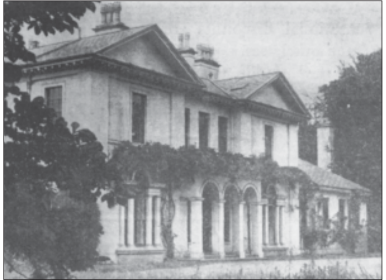
Evington Hall in 1937, home to Basque children refugees. Leicester Mercury, June 1937.