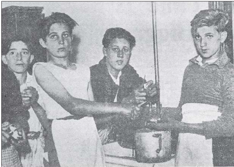
Basque children peeling potatoes at Evington Hall, near Leicester, where a party of refugees are being accommodated.