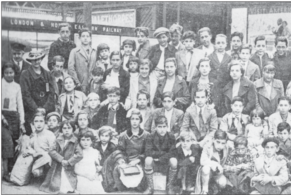
Basque refugee children arriving at Leicester Central Station

On Tuesday 6th July 1937 'a huge crowd of Leicester people waited outside the Leicester Central Station to welcome the Basque children refugees, who are to stay at Evington Hall'. (1) This was a group of 50 children out of the 3,826 who had arrived at Southampton on board the steamship SS Habana from Bilbao in northern Spain, in the largest single influx of unaccompanied young refugees ever to arrive in Britain. They were refugees of the Spanish Civil War. The Expedición a Inglaterra , as the evacuation was called, remains to this day one of the least-known chapters of the Civil War. Leicester played a part in this story.