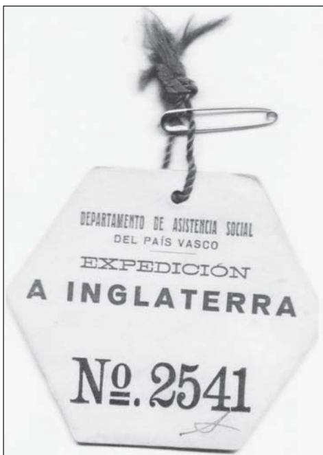
One of the ID tags worn by the children on board the SS Habana.