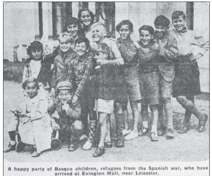
A happy party of Basque children, refugees from the Spanish war, who have arrived at Evington Hall, near Leicester.