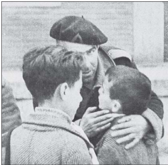
Saying farewell before the SS Habana sailed.