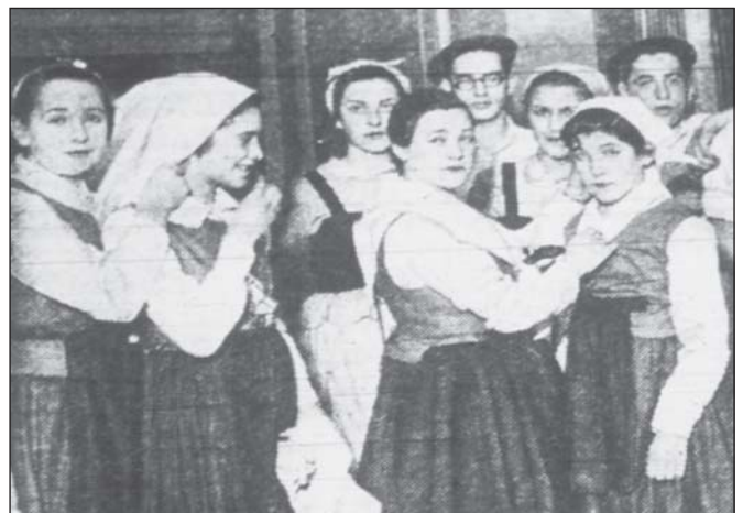
Getting ready for the concert at the Edward Wood Hall, Leicester Mercury, 12th February 1938.

David Attenborough recalls: 'The organisers, including my mother, were of course anxious to engage local people in helping and making the children feel at home. One of the ways of doing that was to arrange parties at the Hall during which the Basque children dressed in an approximation of their traditional costumes, performed regional dances and sang Basque folk-songs.' (32)