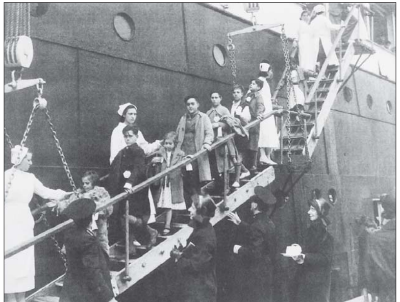
The children disembarking from the SS Habana at Southampton, 23rd May 1937. Members of the Salvation Army wait in the foreground.