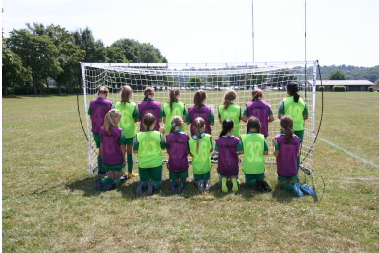
Caerleon Under 9s, those in purple with the names of the Basque Boys on their backs