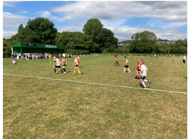
Footballers from Lodge Hill Primary and Charles Williams Primary.