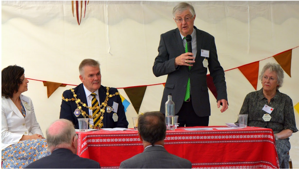
First Minister of Wales Mark Drakeford makes a speech

He continued: “It is so important that we remember what happened and that we continue to draw attention to the links with what happened then, to what is happening now. But also, to draw on that experience to give us the strength to go on forming new relationships in the present day. The relationship between Wales and the Basque Country is so important to us. We both have an outward-looking, European-nation sense that we want to endure, and for the future will lead to advantages to us all.