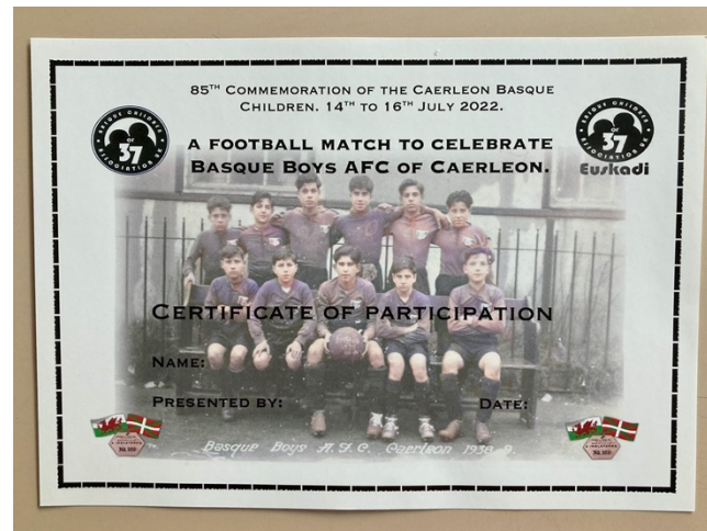
The certificate that each of the footballers received on both days