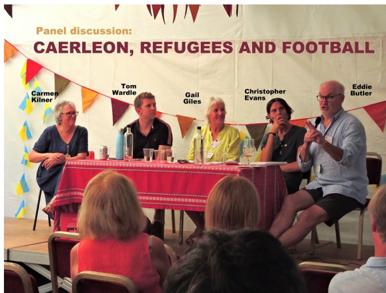
The panel discussion: Caerleon, Refugees and Football