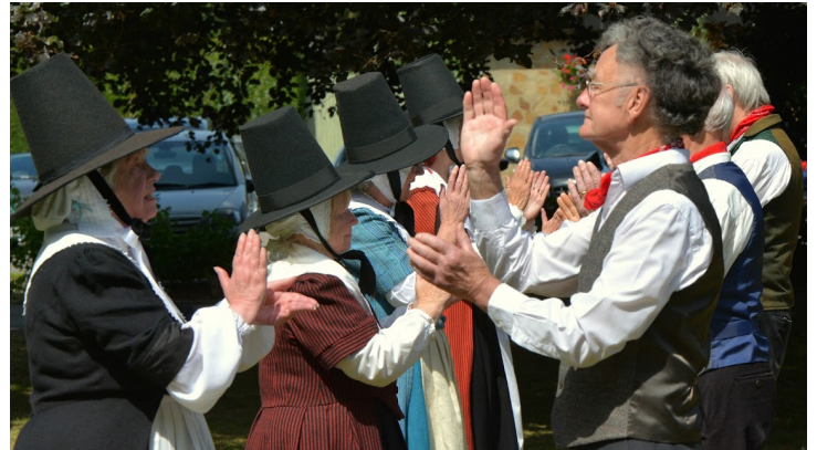
Kezka Dantza Taldea and the Tredegar House Folk Festival Dancers perform in front of onlookers at The Priory, Caerleon