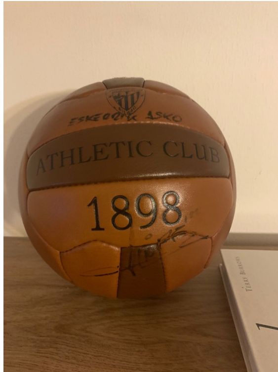
A signed football from Athletic Club de Bilbao was part of the raffle prizes