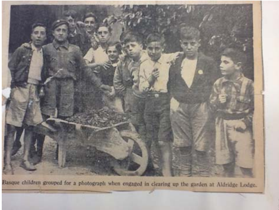
The Birmingham Gazette

The reports about the children were exceptionally good in that they were clean, obedient and willing to help. For the girls their day consisted of making beds, cleaning, helping with making the meals and education. For the boys they helped in the gardens, repaired anything that need repairing and had schooling most days.