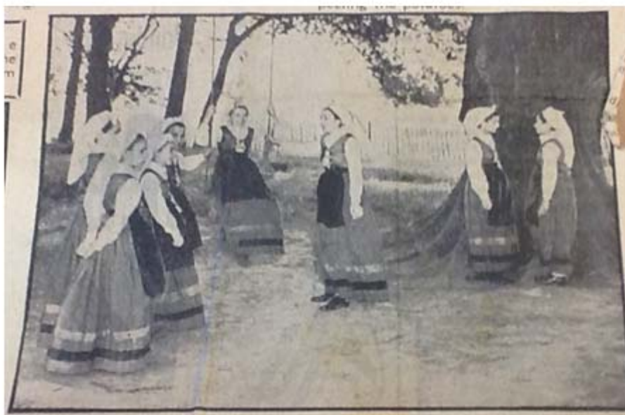
Dancing in the Grounds of Aldridge Lodge

Their days at the lodge according to one of the accounts were happy ones even though most of them were desperate to return to Spain – remember, most of these children were too young to understand what was happening in Spain at the time and had no idea what had happened to their families.