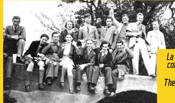
Above: A group including some of the volunteers who fought in Spain pictured in Hull's Pickering Park in the 1930s