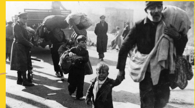
Above: Children from the Basque Country – many of whom found refuge in Hull during the war.