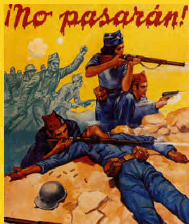
A poster from the Spanish Civil War